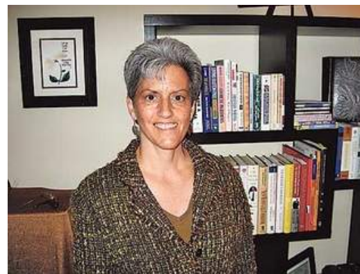
Purchase this Photo

Currently, Fontaine's clients range in age from 18 to 83. She also works with entire families as well as individuals who prefer to communicate solely via the Internet using Skype.